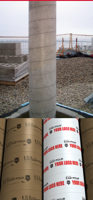
Private Labeling – Your logo available for maximum advertising and visibility on job sites

Caraustar® Easy Pour™ Weather Shield Concrete Forming Tubes – One of the most extensive production networks in the construction marketplace as well as one of the most extensive in all product lines!