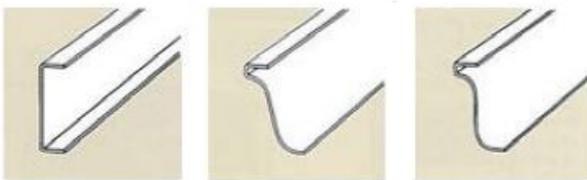
Straight Face-Vertical Double Radius with Batter Double Radius Vertical