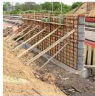
Deslauriers forms used in "Bullnosing" application.